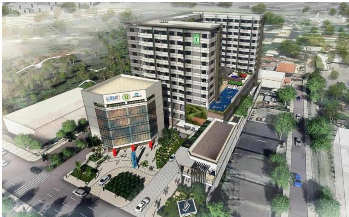
Perspective of Hotel101-Cebu